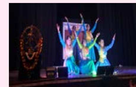
At Heritage Art & Cultural Fest