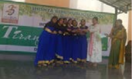
At Deen's Academy