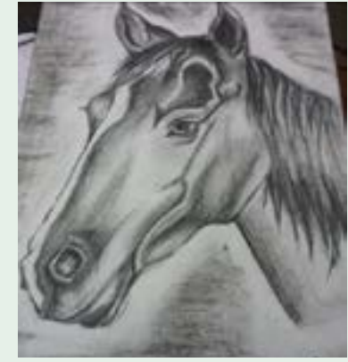
Meera, VII E