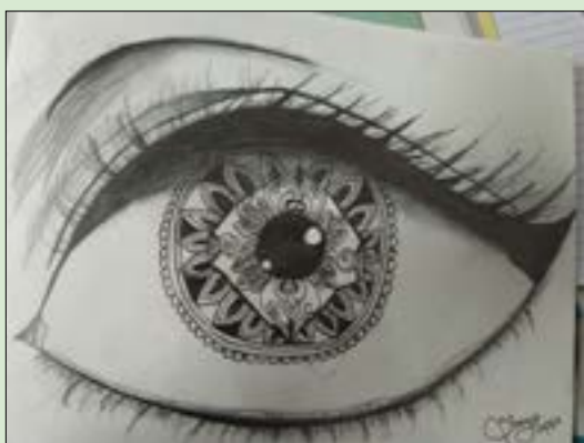
Shreya Bhanot, 10B