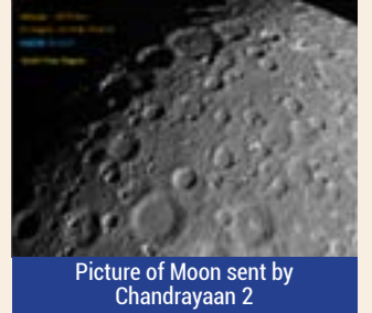
Picture of Moon sent by Chandrayaan 2