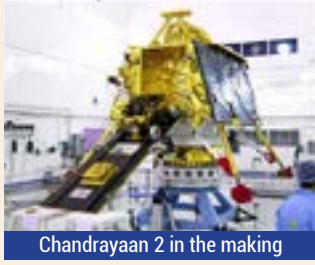
Chandrayaan 2 in the making

Chandrayaan 1 is an Indian lunar probe which was launched on 22 October 2008 by the Indian Space Research Organisation (ISRO). Chandrayaan 1's primary objectives were to analyse the surface of the moon, search for lunar water-ice, create organised data of the lunar chemical and mineralogical imaging and to understand the moon's evolution. After analysing the data given by Chandrayaan 1 which had provided high-resolution spectral data on the mineralogy of the moon, it was revealed that the moon was once completely molten. The probe had also discovered traces of water-ice on the moon. The moon impact probe, had been giving data to Earth for about 312 days, after which communication was completely lost. It was expected to function for up to 2 years, but the mission was called a success as it had completed 95% of its planned objectives.