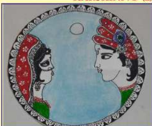
MITHILESH B 8B