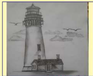
ANANYA JHA 7B