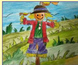
ASWATH TEJA 4C