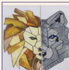
Obuli Sathvik 7C